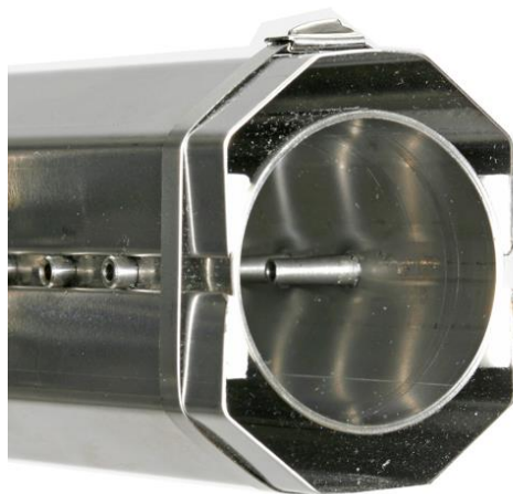
Cross Section of Insulated SAM-e Tube

The SAM-e goes further to guarantee condensate free steam enters the air stream. The nozzle itself takes steam from the center of the steam tube. Since condensate forms on a surface this limits potential condensate from entering the air. Also built into the SAM-e header is a steam separator baffle to remove any droplets traveling with the steam.