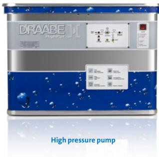
High pressure pump