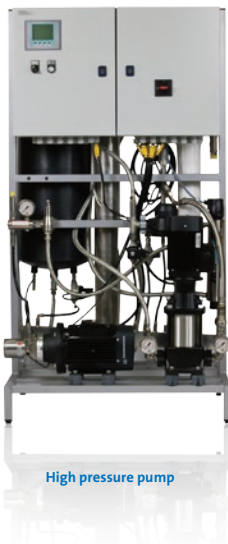
High pressure pump