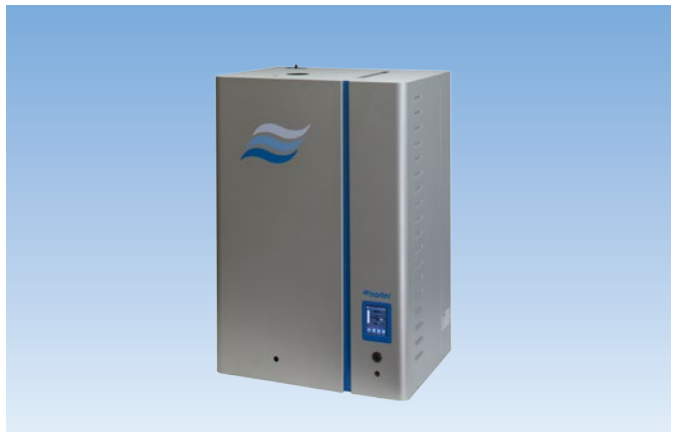
EL-Series Electrode steam humidification

As a leading manufacturer of commercial/industrial humidification systems for more than 40 years, Nortec has the technology and application expertise to meet the needs of any application.