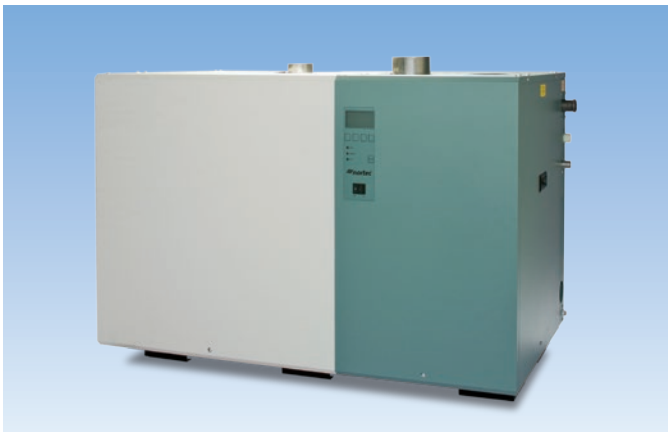
GS-Series Gas-fired steam humidification