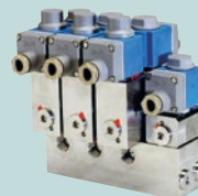
Stage Valve Assembly

The MIST ELIMINATOR protects downstream equipment from water droplets. The media is effective at capturing 99% of droplets and aerosols, has a UL 900 rating, and is compatible with UV light duct sterilization systems.