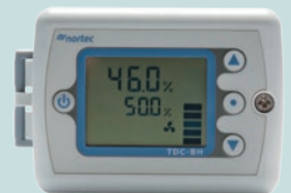
Digital duct control

Humidistats and transducers can either be wall mounted for room humidity control or duct mounted for room humidity and/or high limit control. Both wall and duct controls come complete with a keypad for configuration as well as a backlit digital display.