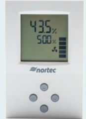
Digital wall control

For humidification safety, Nortec offers an air-proving and high-limit control. The air-proving switch is used to prevent humidifying when there is no air movement in the duct. For high-limit control, an on/off digital duct humidistat is used to avoid over humidification of the supply duct.