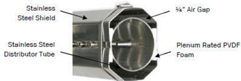
Figure 1: Cross Section of Insulated Distributor

An analogy can be made between the diffusion of heat and electrical charge. The conduction of electricity is dependent on the electrical resistance, just as the conduction of heat is dependent on the thermal resistance.